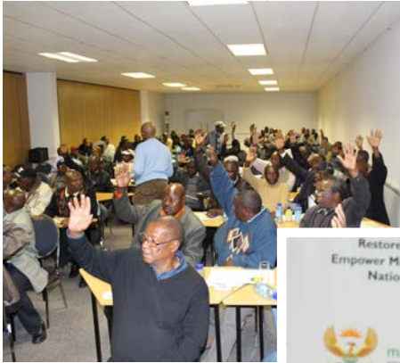
Military Veterans Voting at TDFMVA meeting