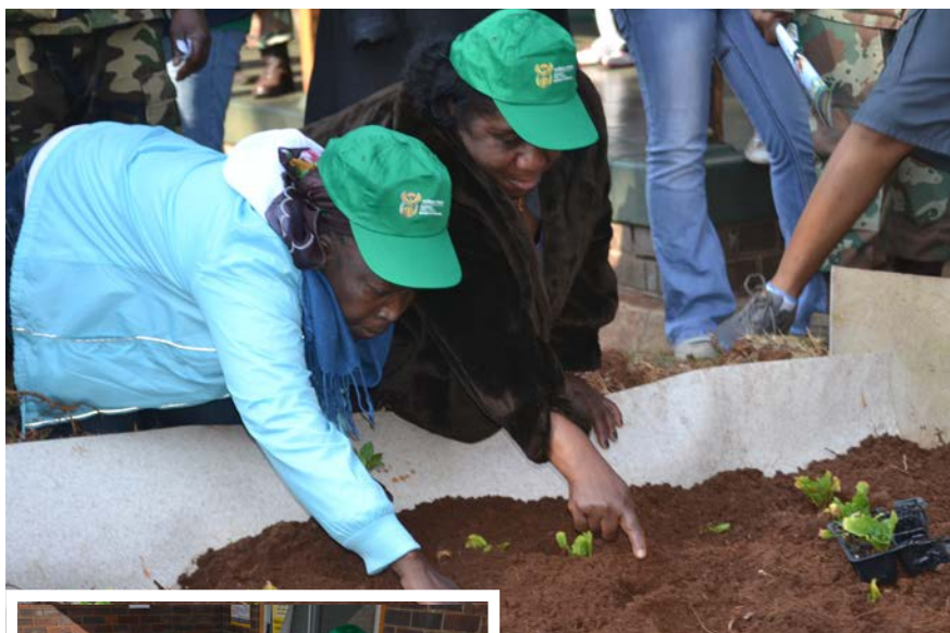
Planting Vegetable during Nelson Mandela Day

This year in particular it was combined with millions of people including the government as a whole and the DMV in particular, wishing Madiba to get well