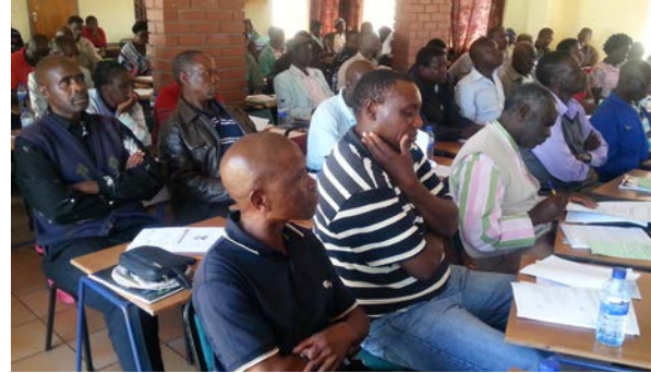
Military Veterans in Limpopo