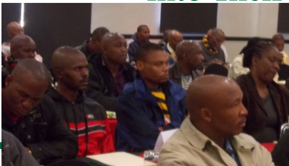
Azanian National Liberation Army Military Veterans Association (AZANLAMVA) members