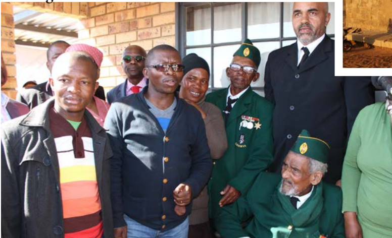
First beneficiaries of DMV housing programme along with their family members