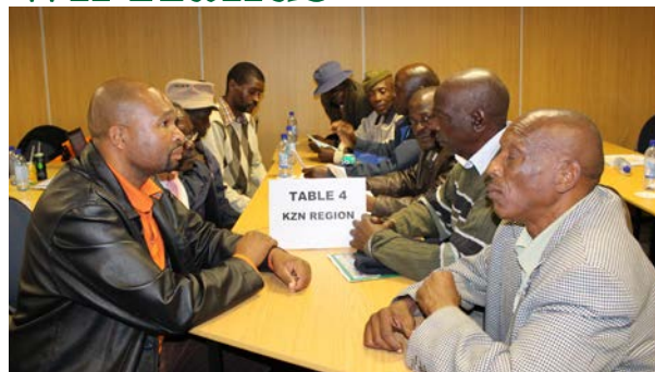
TDFMVA members discussing during election process in Umthata