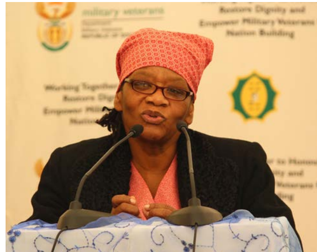
North West Premier Ms Thandi Modise

The Deputy Minister of Defence and Military Veterans Thabang Makwetla said it was important that the two military veterans who fought during the WWII should be provided with houses.