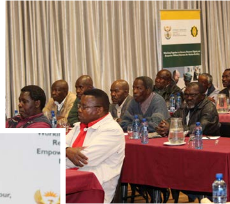
CDFMVA in East London (EL)