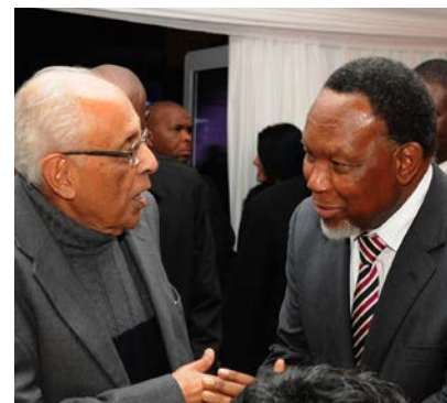
(Left) Deputy President Kgalema Motlante (Right) Ahmed Kathrada

President Zuma also spoke about former President Nelson Rolihlahla “Madiba” Mandela, who posed as a gardener while living on the Liliesleaf farm.