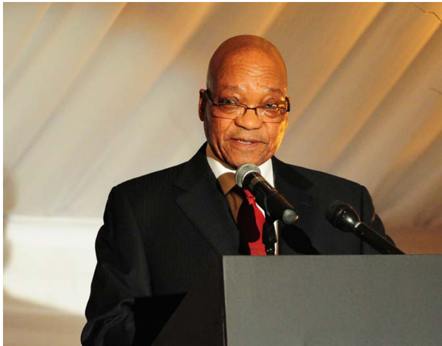
The President of South Africa Jacob Zuma addressing guests at Lilies Leaf Farm