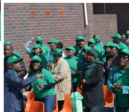
Joy was expressed through singing unity songs during Mandela Day

Be in the education, health and human solidarity front