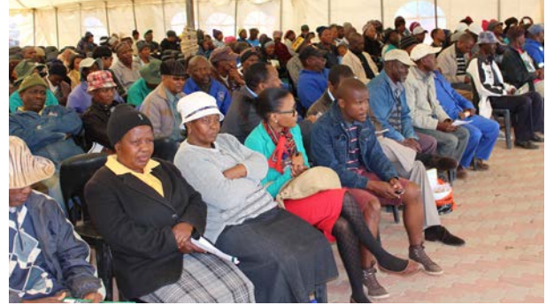
Community members of Kraaipan

Working Together to Honour, Restore Dignity and Empower Military Veterans for Nation Building