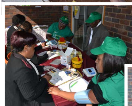
Nurses providing health tests

soon as he fights for his life at the Media Clinic in Pretoria. The DMV event for Madiba took place at the Lenasia Sick Bay that provides medical services to military veterans. The DM also went on to read the letter that he had read in the Sowetan which we have the pleasure to publish, for, as the DM said, “that letter says it all.”