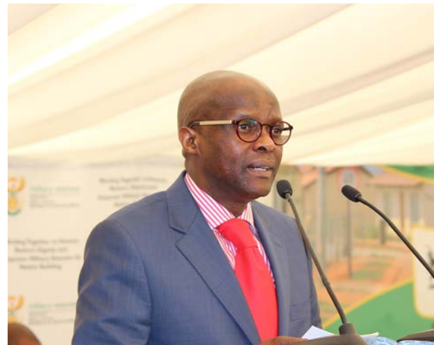
Deputy Minister Mr Thabang Makwetla