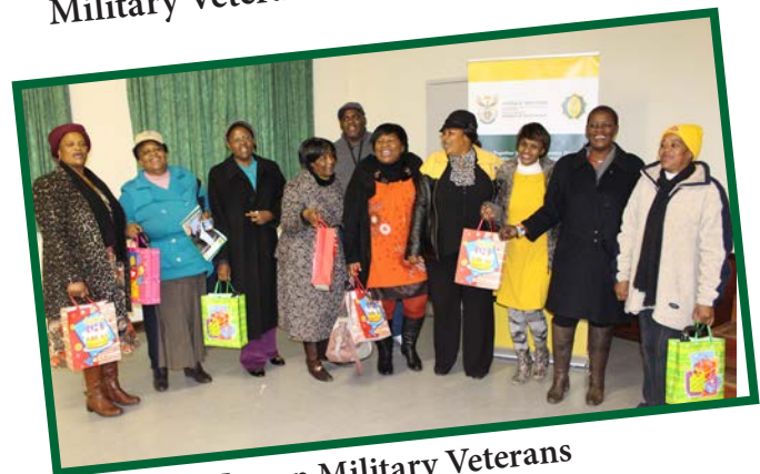
Umnzana Women Military Veterans

On behalf of the military veterans community to which Nelson Rolihlahla "Madiba" Mandela is an integral part, the DMV welcomes his discharge from the Pretoria Medi Clinic Heart Hospital on 2nd September 2013 after spending 85 days since his admission on the 8th June 2013. Honour once again joins the nation and the world in wishing him speedy recovery. As the DMV and military veterans community move towards establishing a new umbrella body this month, which is Iso Heritage Month, will continuously draw inspiration from you and other stalwarts in making sure that the umbrella association works in a fair, transparent, accountable manner in the interest of all military veterans.